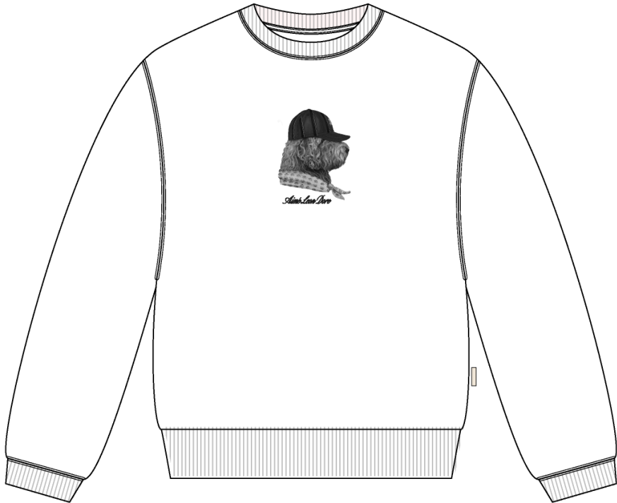
Buddy Crewneck 26