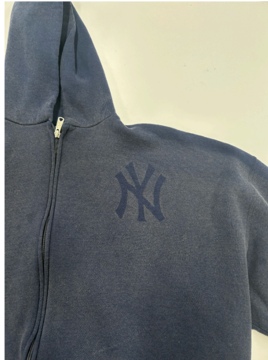
6_Artwork Execution Reference-1