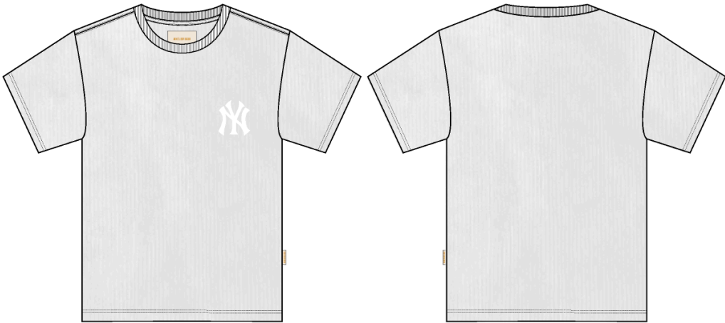
SS Yankees Tee