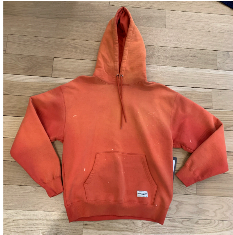
5_Garment Dye Reference-1