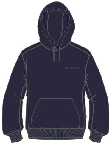
EVENING BLUE - RIB: DTM - DRAWCORDS: DTM - EYELETS: ANTIQUE BRASS