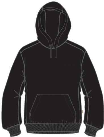
JET BLACK - RIB: DTM - DRAWCORDS: DTM - EYELETS: ANTIQUE BRASS