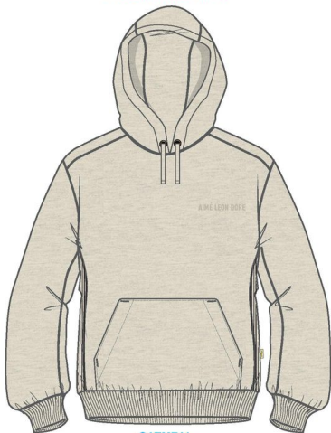
OATMEAL - RIB: DTM - DRAWCORDS: DTM - EYELETS: ANTIQUE BRASS