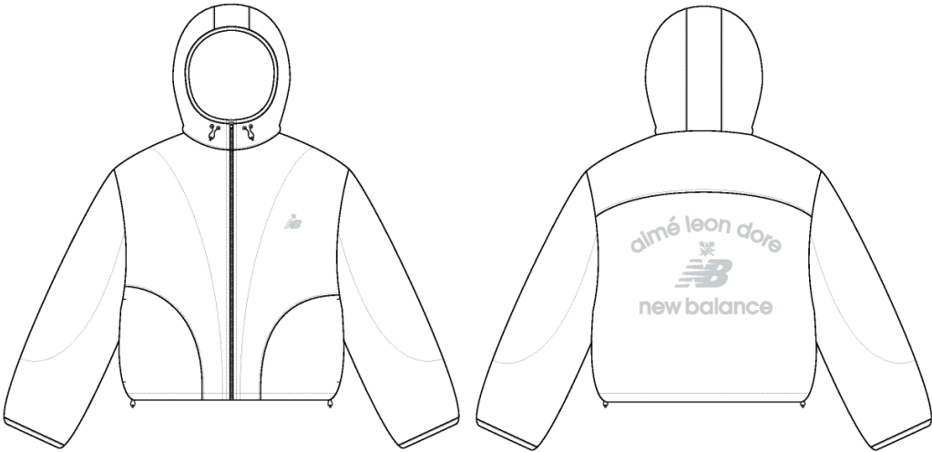
NB Zip Hoodie