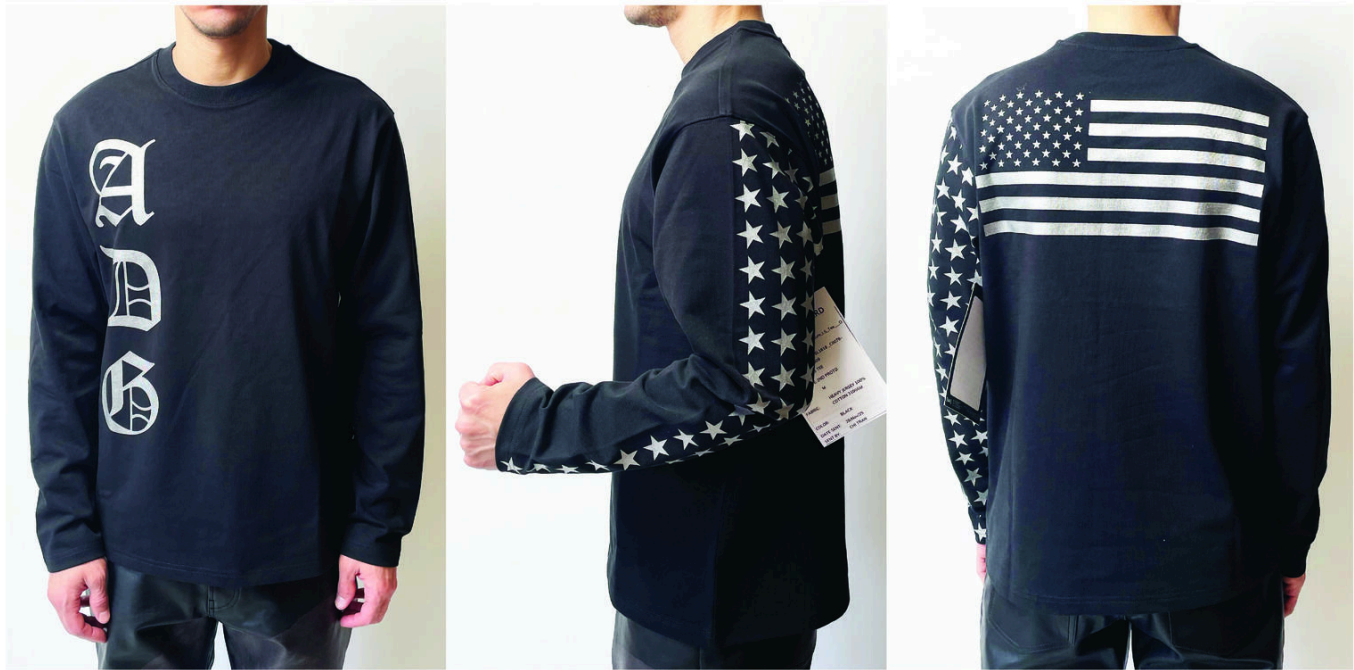
SS26TSL1618 ADG Scripture LS Tee - PPS.jpg