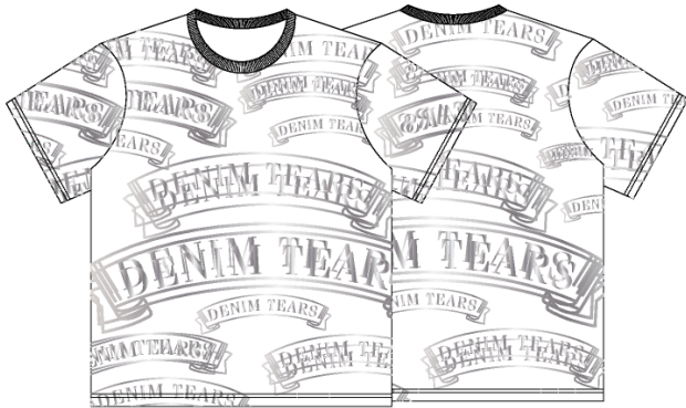
ADG BANNER PRINT-TEE-SS26-1

COLORWAY 2: BRIGHT WHITE: 11-0601 TCX GRAPHIC: METALLIC INK