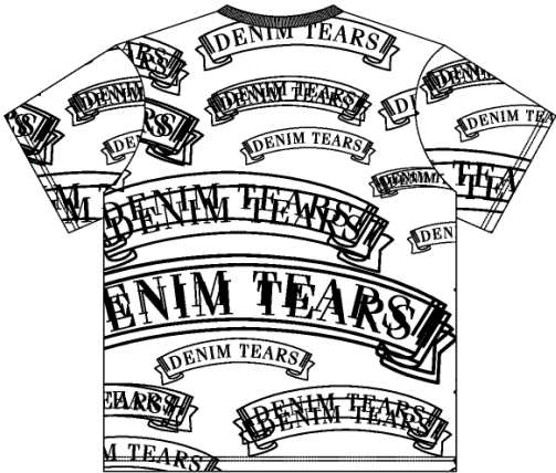
ADG BANNER PRINT-TEE-SS26-4