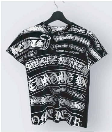
ADG BANNER PRINT-TEE-SS26-5

MATCH FOR PRINT QUALITY, PRINT ALLIED AFTER GARMENT CONSTRUCTION LIKE REF, ONLY ON FRONT