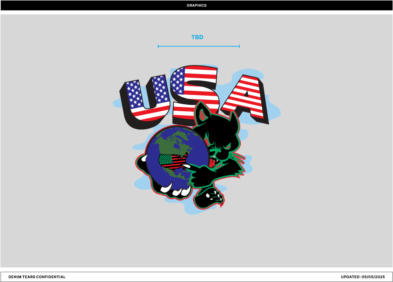
SS2026 - Long sleeve Taz-4