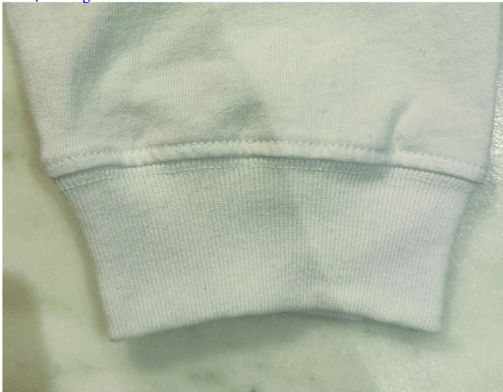
SS26TSL1571 Taz LS Tee - 1st Proto-02.jpg