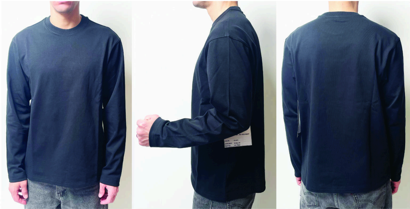
SS26TSL1571 Taz LS Tee - 1st Proto-01.jpg