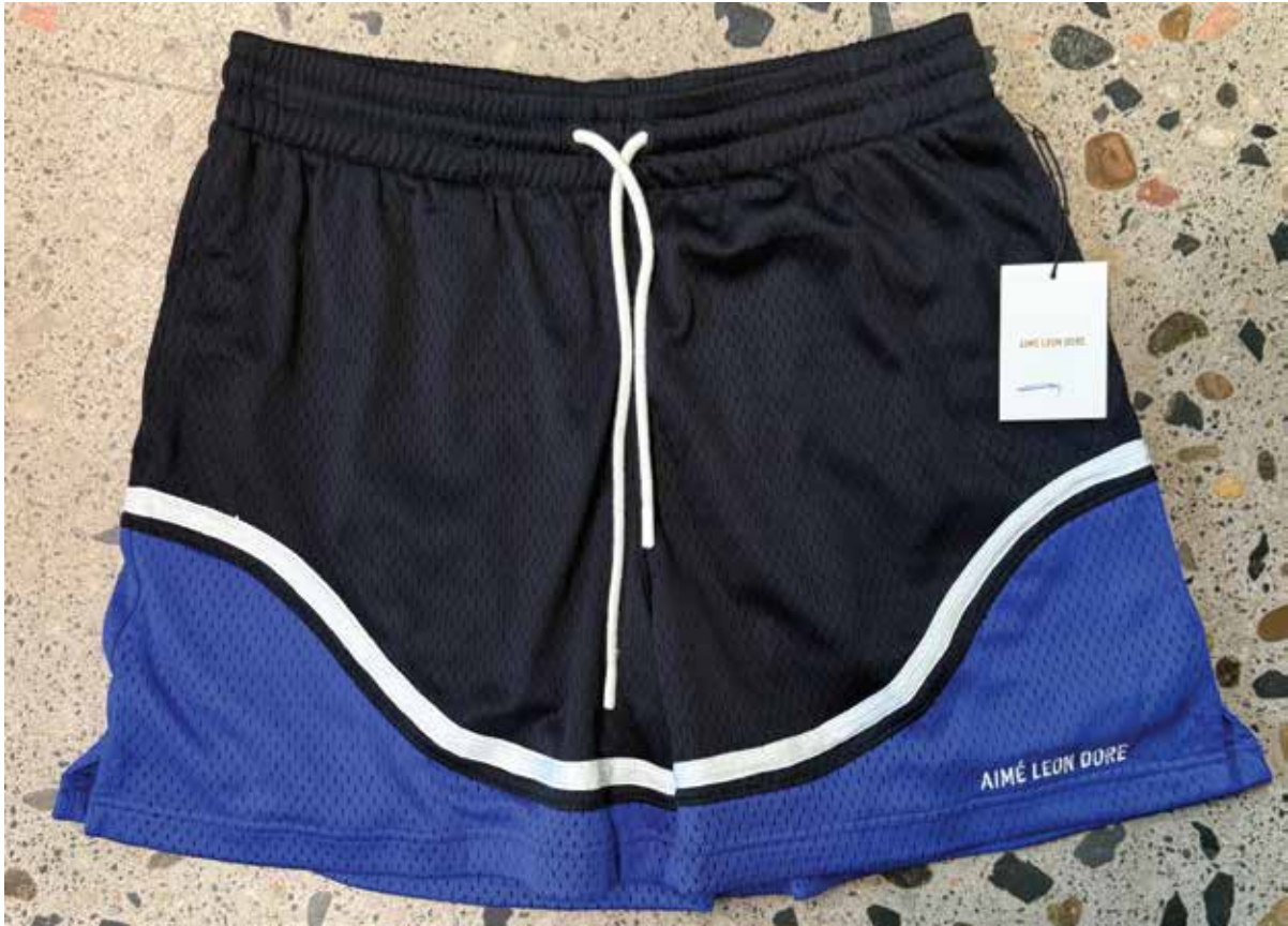
RIB OPTION 1: