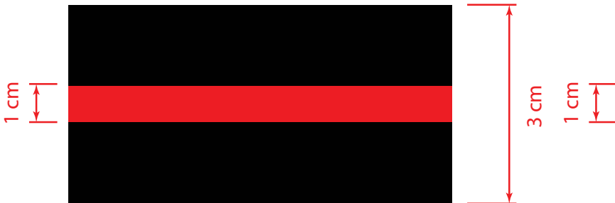
RIB OPTION 2: