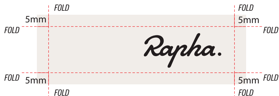
LOGO TO BE SCREEN PRINT