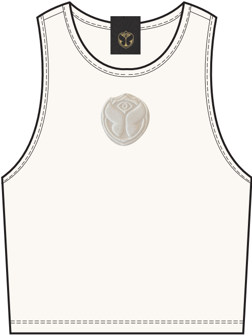
Twinstitch on hem