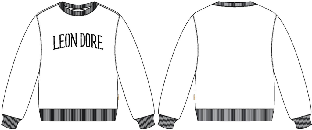
Leon Dore Crewneck