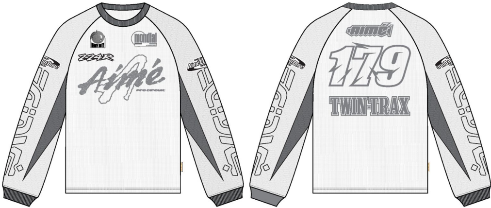
LS Moto Jersey