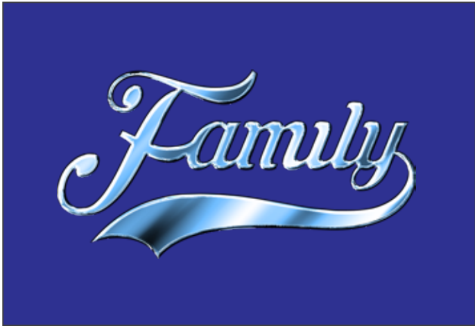
PRINT PER COLOURS ON FILE

BLUE HOODIE *USE FILENAME = FAMILYSCRIPTBLUE.PNG