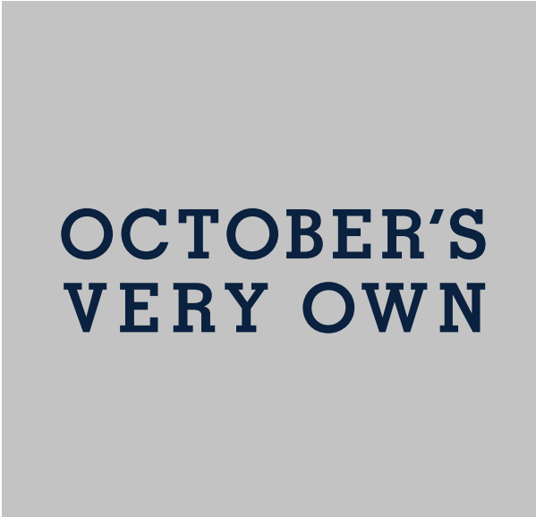
LEFT ARM ARTWORK OVO TEXT LOGO SCREEN PRINT ARTWORK IS NOT ACTUAL SIZE ARTWORK SIZE 4.5"W x 1.33"H