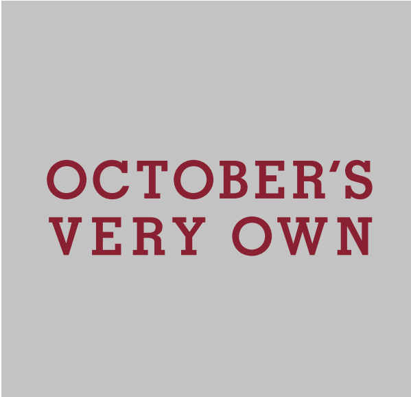
LEFT ARM ARTWORK OVO TEXT LOGO SCREEN PRINT ARTWORK IS NOT ACTUAL SIZE ARTWORK SIZE 4.5"W x 1.33"H