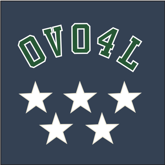
WHITE ISACORD 5555