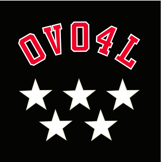
WHITE ISACORD 1904