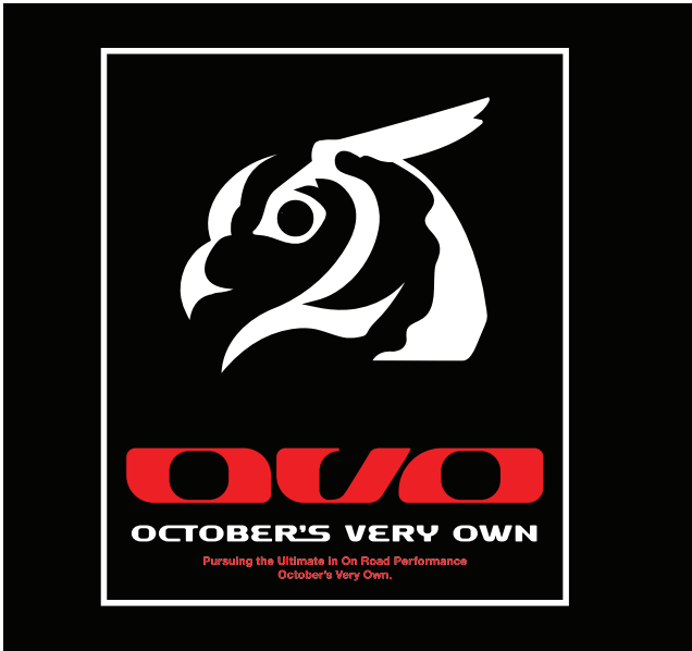
BLACK COLOURWAY WHITE PANTONE 185 C

SCREEN PRINT PLEASE NOTE BLACK COLOURWAY ARTWORK IS SLIGHTLY DIFFERENT THAN GRAY AND TAN COLOURWAYS ARTWORK SIZE: 15”H x 12.58”W