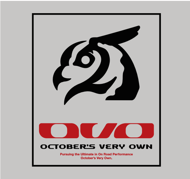
GRAY COLOURWAY BLACK PANTONE 185 C