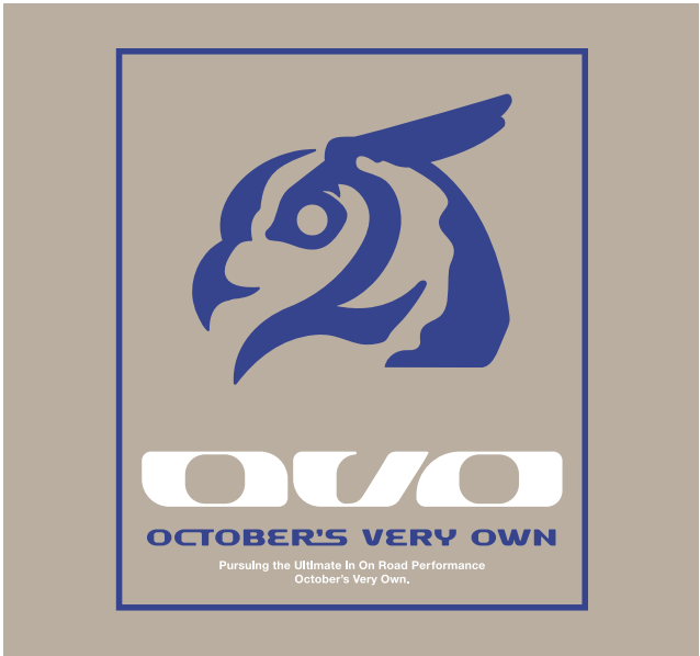
TAN COLOURWAY WHITE PANTONE 7687 C