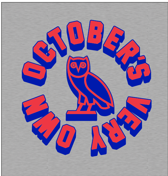
GRAY COLOURWAY PANTONE 199 C PANTONE 3591 C