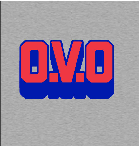
GRAY COLOURWAY PANTONE 199 C PANTONE 3591 C